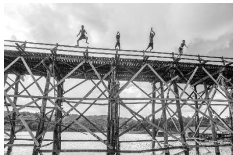
Francesco Soave, Flying Kids , 2017.