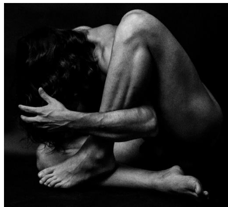
Matteo Piacenti, Senza Titolo #3 , 2020.

© Matteo Piacenti Courtesy MUSEC / 29 ARTS IN PROGRESS Gallery