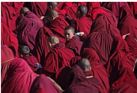
Jian Luo, The Maiden Nun , 2018. © Jian Luo, Courtesy MUSEC / 29 ARTS IN PROGRESS Gallery