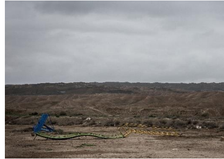
Farnaz Damnabi, Playing is my right, n. 5 , 2018. © Farnaz Damnabi, Courtesy MUSEC / 29 ARTS IN PROGRESS Gallery