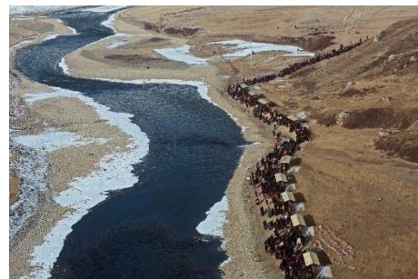
Jian Luo, Pilgrimage , 2019