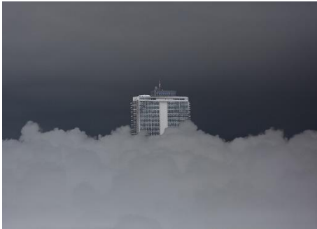
Gabriel Guerra Bianchini, The Capitol , 2016.