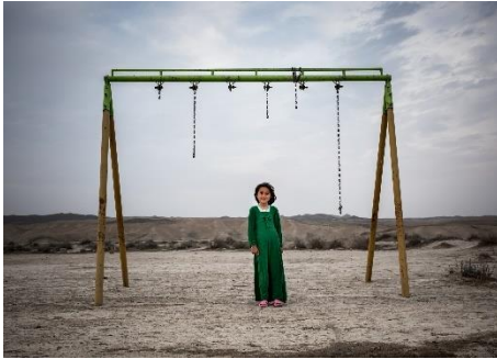
Farnaz Damnabi, Playing is my right, n. 2 , 2018. © Farnaz Damnabi, Courtesy MUSEC / 29 ARTS IN PROGRESS Gallery