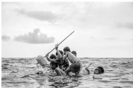
Francesco Soave, Escape from Trash Island #1 , 2019.