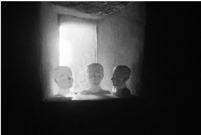
04. Agostiniani (Augustinians) Eremo di Santa Caterina, Isola d'Elba 1990