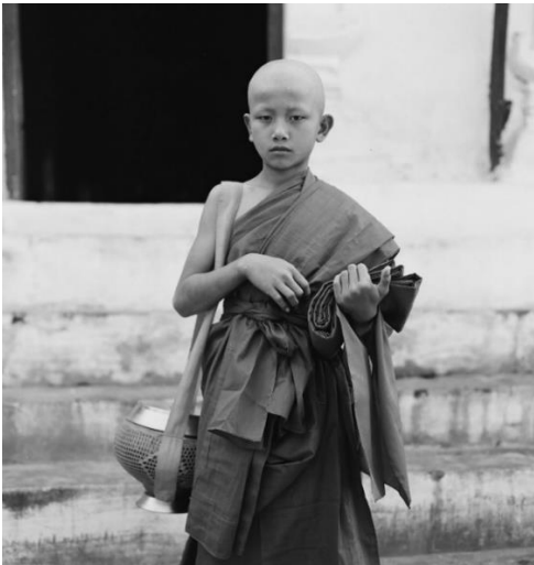
07. Tjua Vat Pak Khan, Luang Prabang, Laos 2000