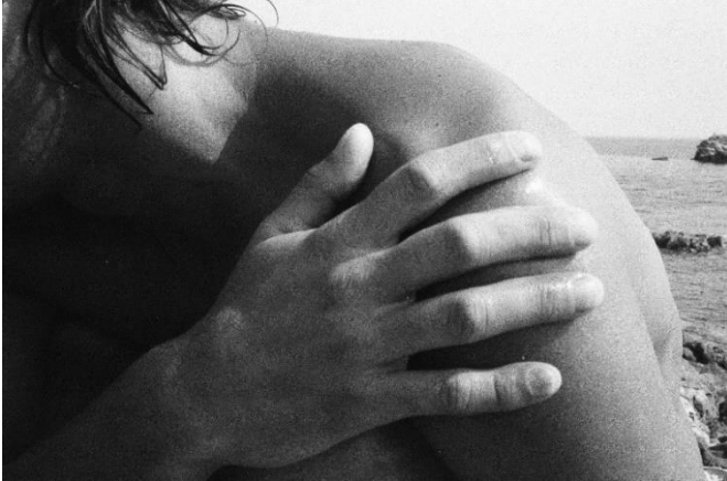
03. Consapevolezza (Awareness) Zuccale, Isola d'Elba 1984