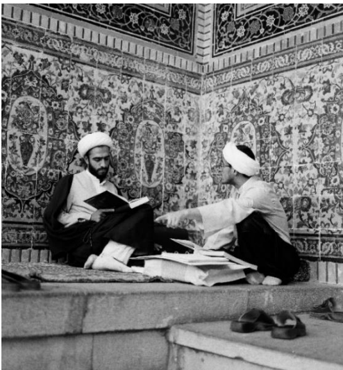
09. Discussione teologica (Theological discussion) Qom, Feyzieh, Iran 2003