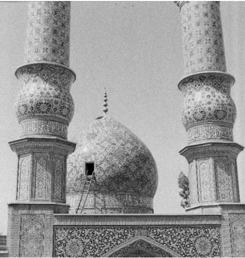
12. L'umanità della perfezione (The Humanity of perfection) Qom, Iran 2003