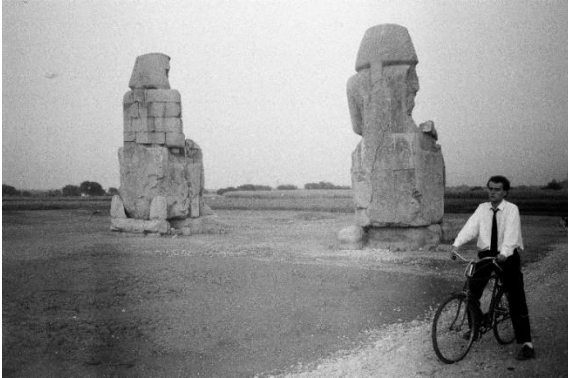
06. I colossi di Memnone ( Memnone Colossus ) Luxor, Egitto 1984