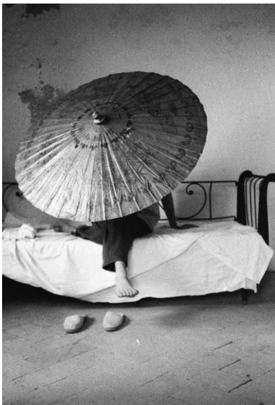
05. L'abbrivio (Momentum) Eremo di Santa Caterina, Isola d'Elba 1978